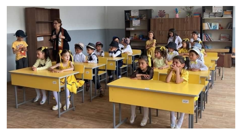
IWAY continued to support the Drakhtik Village School

In 2022, The International Women's Association of Yerevan (IWAY) continued supporting the Drakhtik village school.